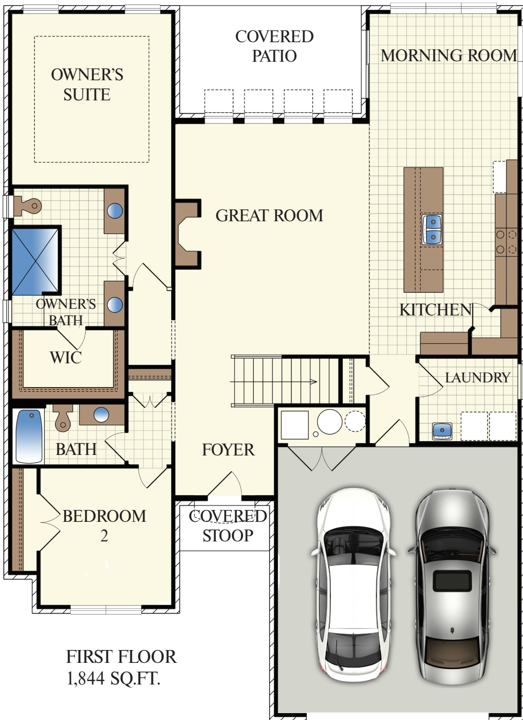
FIRST FLOOR 1,844 SQ.FT.